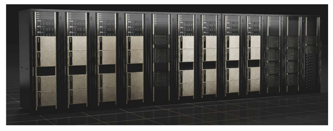
Fig. 3: Rendering of NVIDIA SuperPOD