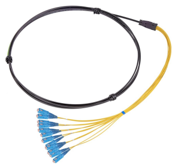
Fiber Optic Cable Assembly, 12 SC/UPC to Stub, 12-fiber, 1550 Feet