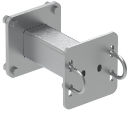
Stand-off Arm with U-bolts, 12 in