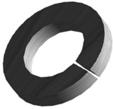
Galvanized Lock Washer, 5/8 in