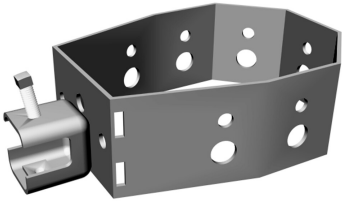
Cluster Support Bracket with angle member attachment