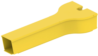
FiberGuide® Straight Reducer, 2x2 to Dual 2x2in, Yellow