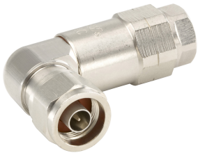
Type N Male Right Angle for 1/2 in FSJ4-50B cable