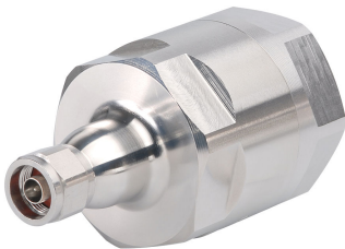
Type N Male Positive Stop™ for 1-5/8 in AVA7-50 cable

This product was discontinued on: August 21, 2008