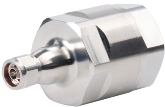
Type N Male Positive Stop™ for 1-5/8 in cable