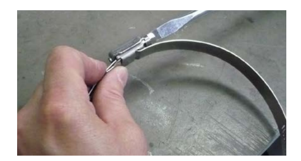
Step 1 - Unscrew the clamp