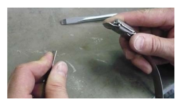
Step 2 - Open the clamp