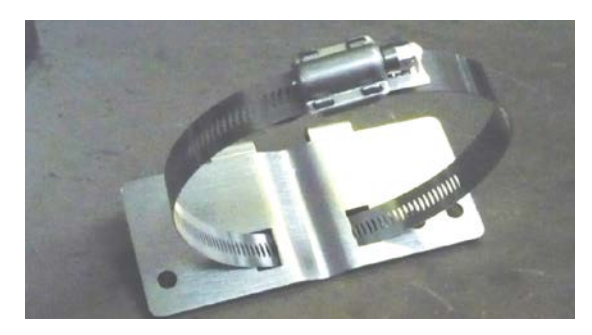
Step 6 - Fully assembled

Since 1937, ANDREW, an Amphenol company, has driven the evolution of wireless technology. Trusted by mobile network operators and enterprises globally, we work closely with our customers to deliver innovative solutions that enhance connectivity experiences both outdoors and indoors. Our dedicated global team is committed to advancing the industry, fueled by the vision that a better-connected future is possible.