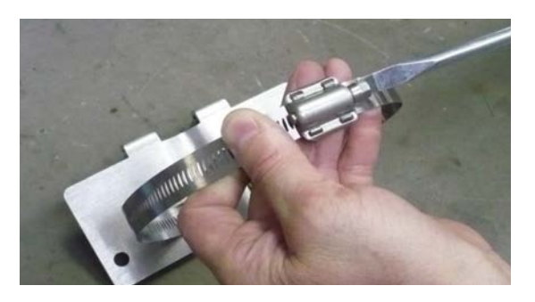
Step 5 - Tighten the screw along the band up to the required torque (recommended 7.5 to 10Nm max) by means of a screwdriver