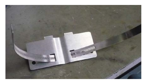
Step 3 - Insert clamp into bracket