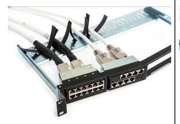
Connect the MRJ21 connector.

2.2. Installation of Pre-Terminated Cable Bundle