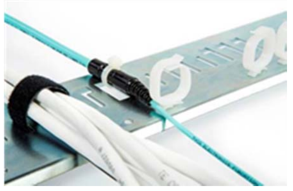
Install midi fan-out.