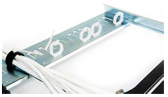
Attach the white cable clips and position the reusable cable tie.