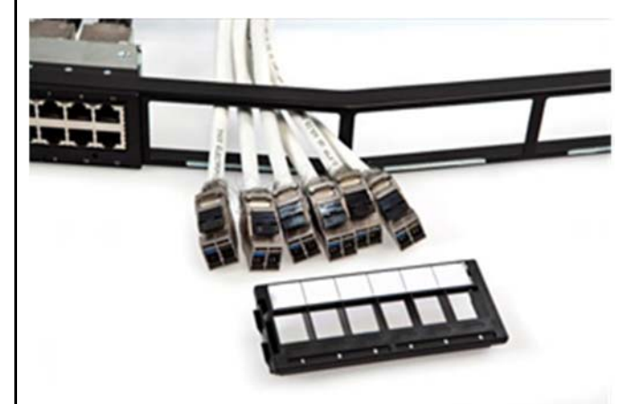
Feed the pre-terminated bundle through the cut out in the panel.

2.2. Installation of Pre-Terminated Cable Bundle