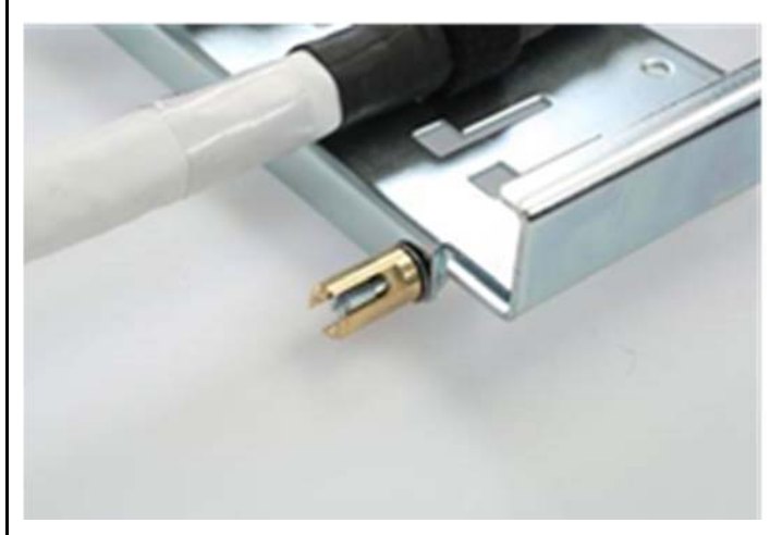
Install the grounding bolt at the back of the panel.