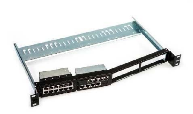
Insert the MRJ21 & MRJ21 XG cassette.