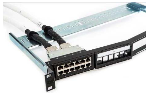
Insert the Sigma-Link front cover.