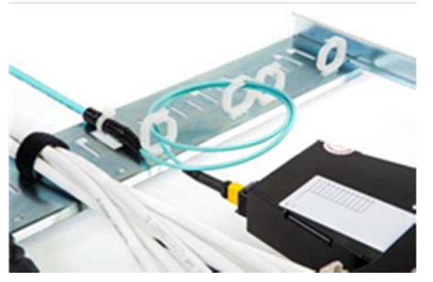
First clean MPO connector end face in the rear of the cassette, then insert the Quick-Fit MPO cassette into the UCP panel. Next clean the MPO connector end face from the incoming cable, dressing it into the cable clips at the rear of the panel (maintaining a minimum bend radius of 50mm at all times). Finally, connect the incoming MPO cable to the MPO cassette.