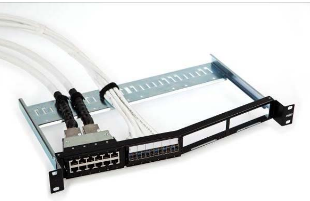
Insert the Quick-Fit module into the panel, and secure the cable bundle with hook-and-loop fasteners.