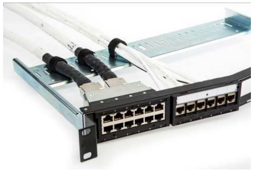
Secure the cable with hook-and-loop fasteners.