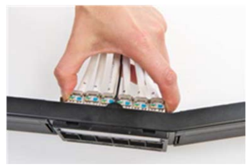
To remove the assembly: push the side-taps outward whilst at the same time pulling the cable bundle towards the rear of the panel.

2.4 Termination Guidelines for Sigma-Link Cassette-to-Open-End (Y-1671218-X, Y-1671221-X, Y-1671224-X)