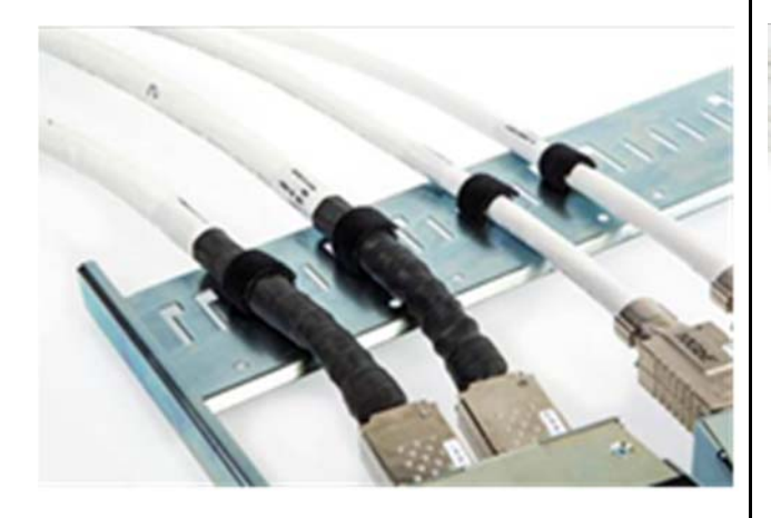
Secure the cable with hook-and-loop fasteners.