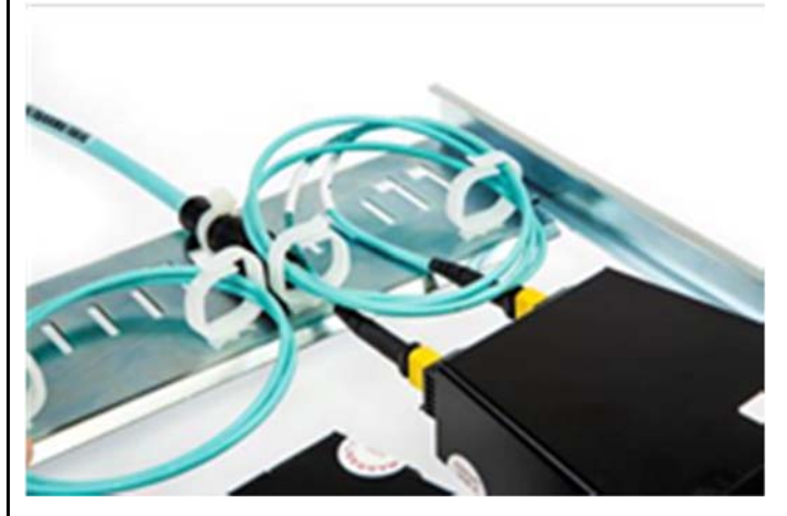
First clean MPO connector end face in the rear of the cassette, then insert the Quick-Fit MPO cassette into the UCP panel. Next clean the MPO connector end face from the incoming cable, dressing it into the cable clips at the rear of the panel (maintaining a minimum bend radius of 50mm at all times). Finally, connect the incoming MPO cable to the MPO cassette.

Note: Unused ports can be covered by blank Quick-Fit modules.