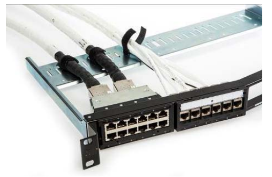
Insert the Sigma-Link assembly into the opening of the patch panel. Check TOP marking on the module and front cover. An audible click indicates the cassette is in position.