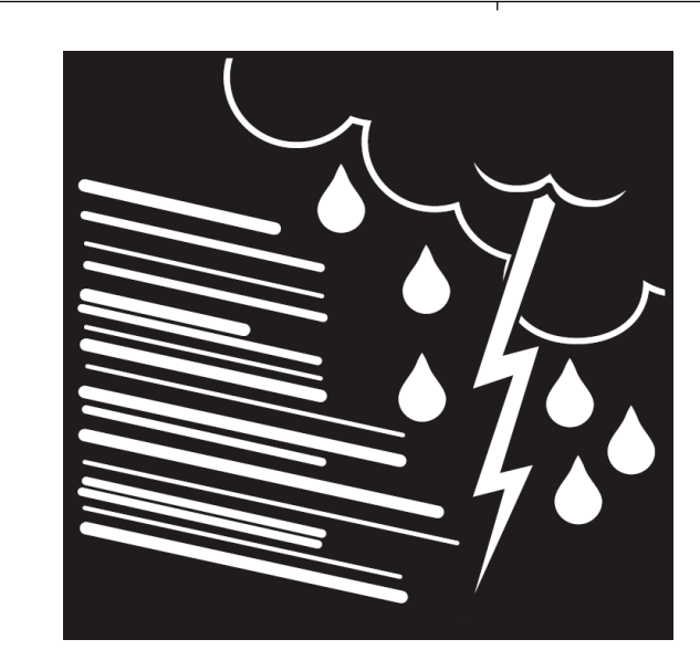
Do not install on a wet or windy day or when lightning or thunder is in the area. Do not use metal ladder.