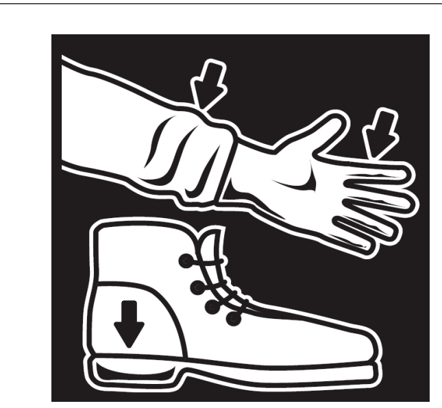
Wear shoes with rubber soles and heels. Wear protective clothing including a long-sleeved shirt and rubber gloves.