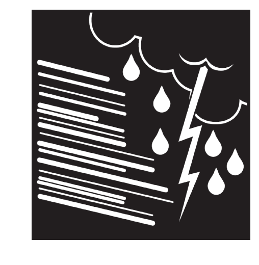
Do not install on a wet or windy day or when lightning or thunder is in the area. Do not use metal ladder.