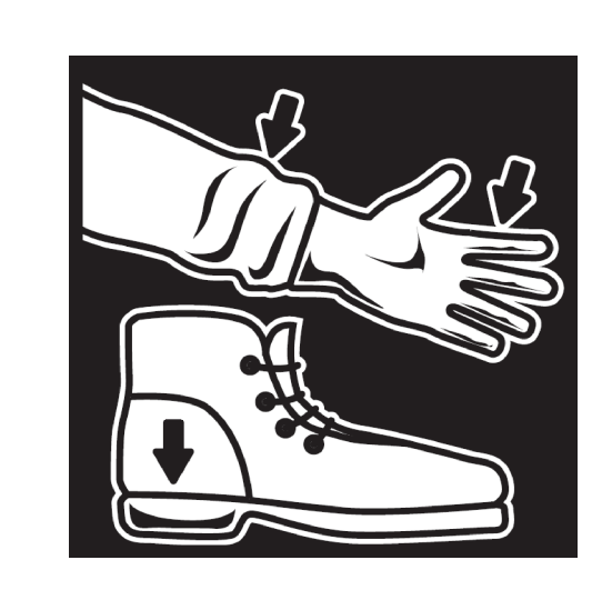
Wear shoes with rubber soles and heels. Wear protective clothing including a long-sleeved shirt and rubber gloves.