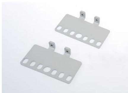
FOMS-FPS-O-MB2-M - FIST-MB2-2HU-M