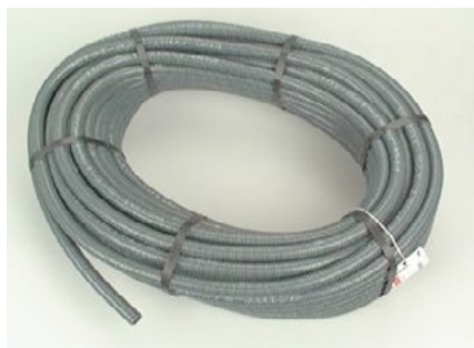
FIST-GS-FLEX-7-50 - FIST-GS-FLEX-10-50