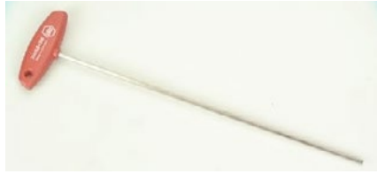
Long Allen key