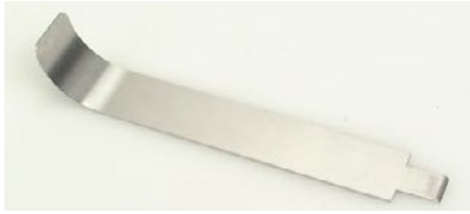
Cage nut tool