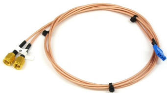
TMA Power Cable, dual SMA male to receive multicoupler, 0.8 m