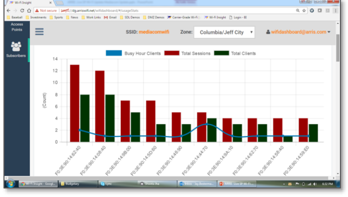
Network Intelligence Dashboard