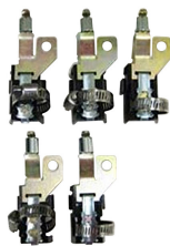
Mini-OTE 300-Series, Optical Terminal Pole Cable Retention Kit