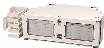
FL2000 Fiber Termination Panel, 48 SC/UPC, multimode, 3RU, 19 in, putty white