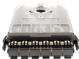
SYSTIMAX 360G2 Cassette 6 ST OptiSPEED® Beige with Pigtails A