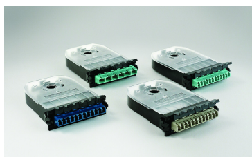
G2 Modular Cassette with 6 ST TeraSPEED® Singlemode Pigtails, Type A