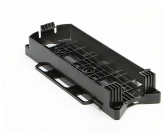
DLX® Mini-MST, Fiber Optic Universal Mounting Bracket