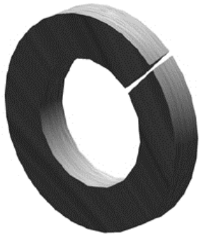
Galvanized Lock Washer, 5/8 in