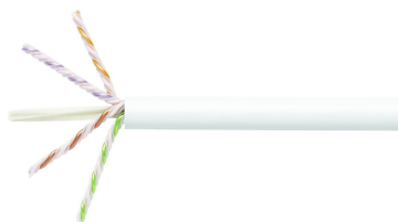
GigaSPEED X10D® 2091B ETL Verified Category 6A U/UTP Cable, 4 pair count